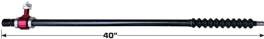
405-10326 Rayburn w/Mono-ball